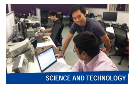
Hackathon could transform drone technology more