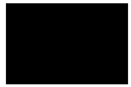
4000 students graduate & four new Honorary Doctors named more