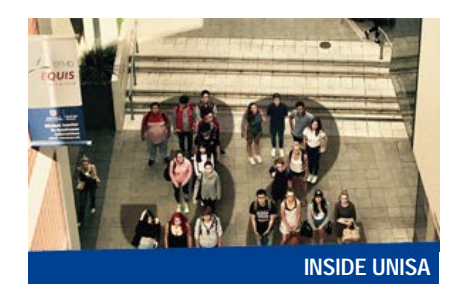
UniSA rockets to 32 in THE world's best young universities more