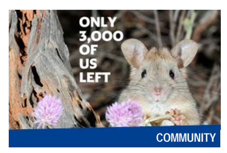
Help save me! Crowdfunding closing very soon... more