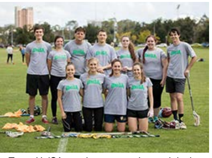
Team UniSA won lacrosse and squash in the 2017 SA Challenge, taking out the overall title.

The high participation rate and strong resulted helped Team UniSA be crowned number one in the state in 2017.