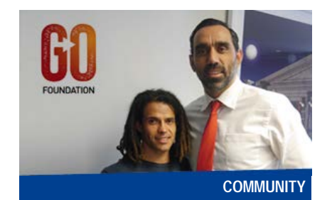
First GO Scholarship winner announced more