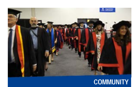
4000 students graduate & four new Honorary Doctors named more