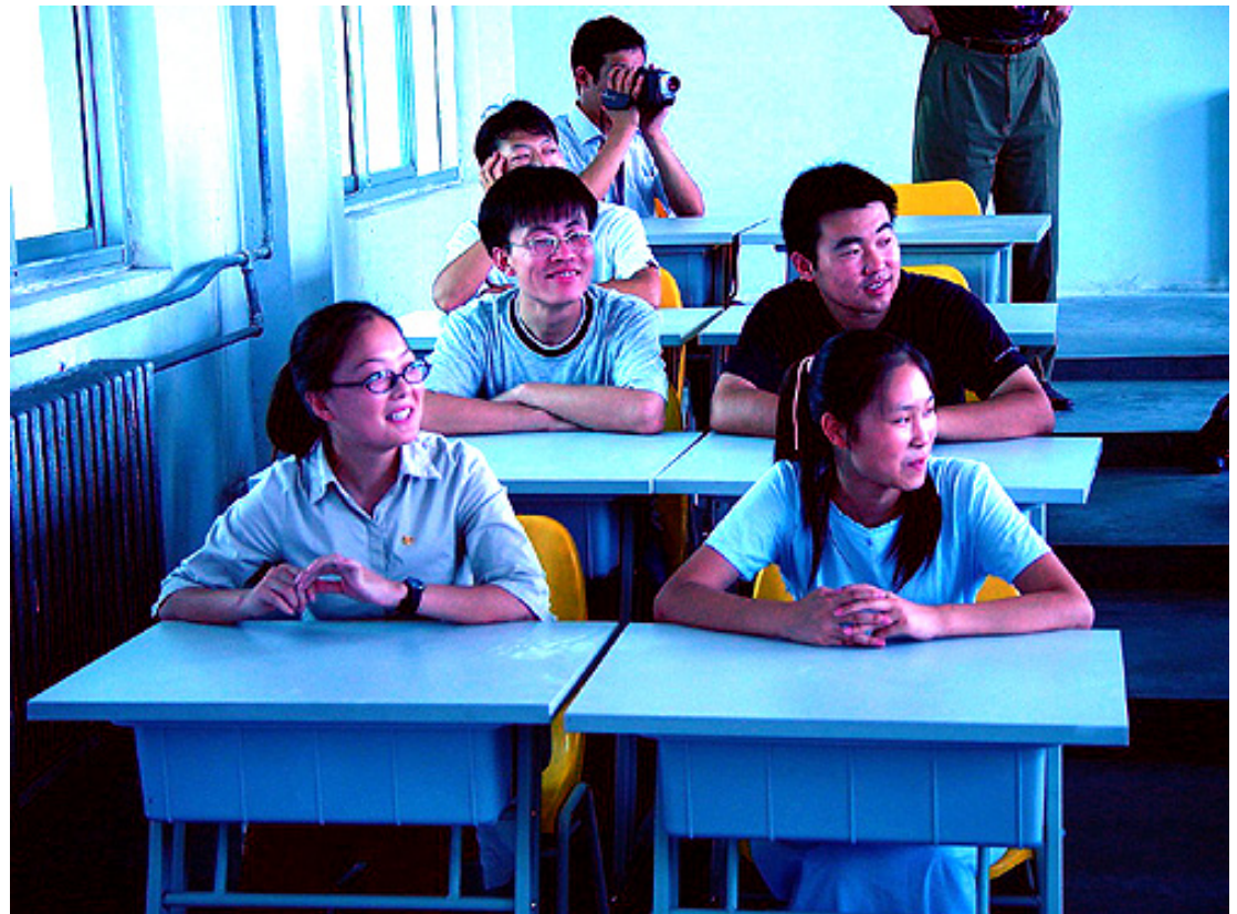
Xian International University students eager to enter the English-speaking global market

The recent launch of the Xian International University (XIU), in Xian on September 1, heralds an exciting new step in China-Australia cooperation.