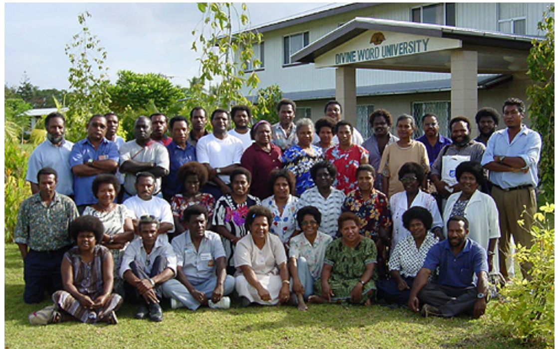
Educating the educators: The group of teachers being trained by de Lissa staff in Papua New Guinea

De Lissa Institute of Early Childhood and Family Studies are playing a major role in an AusAid plan to help Papua New Guinea achieve universal primary education by 2004.