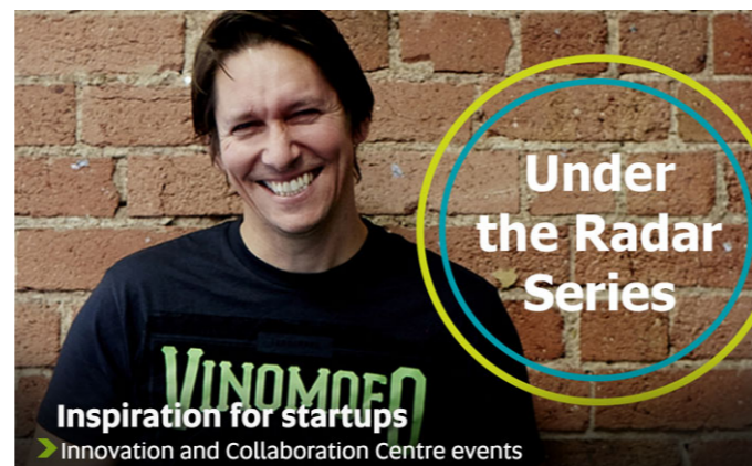
Inspiration for startups ➤ Innovation and Collaboration Centre events