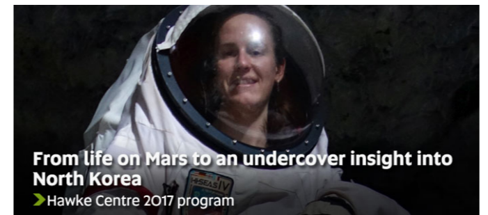
From life on Mars to an undercover insight into North Korea ➤ Hawke Centre 2017 program