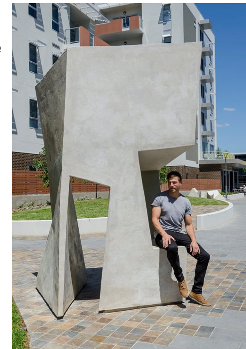
Transition...109, GRC Coating, Steel, 3000mm x 1500mm x 1500mm x 1500mm, 2015.

Steven will make two more trips to Bandung to work with Arin to complete the Passage of Sound sculpture before it is unveiled in November 2017.