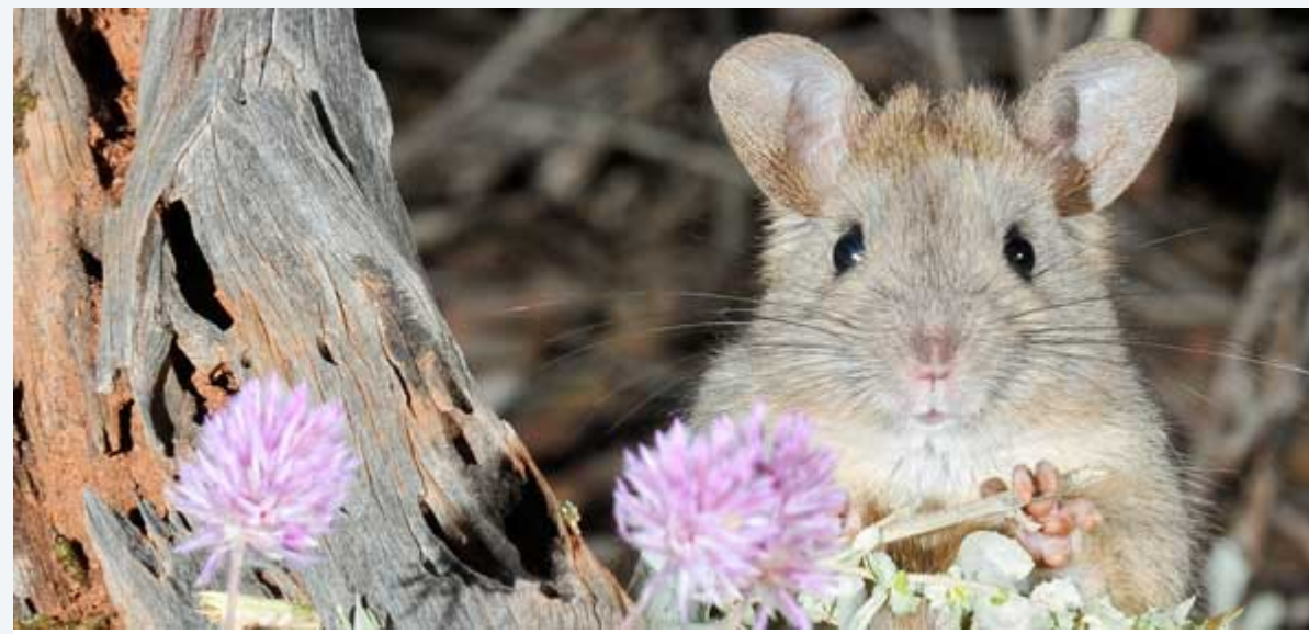
Greater Stick-Nest Rat